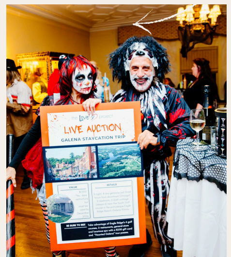
Auction + Raffle